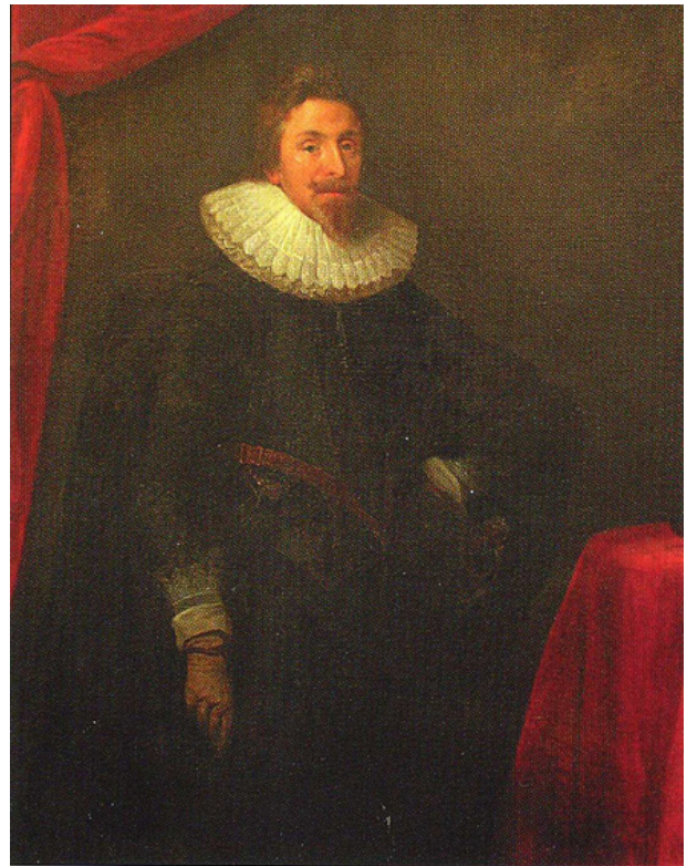
Portrait of George Calvert, 1954,

After King James I died, his son, Charles I, became the new king of England. In 1632,